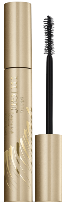
HUGE EXTREME LASH MASCARA $23

Yes, it takes off all your makeup with just water! (We're wowed, too.)