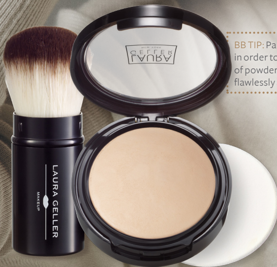
KABUKI BRUSH $29

INCLUDES: 10 eye shadows, 2 highlighters, blush and double-ended face and eye brush