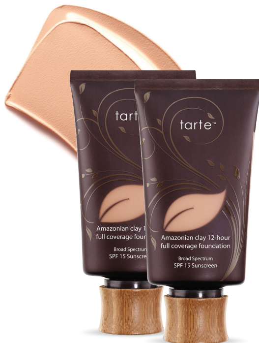
AMAZONIAN CLAY 12-HOUR FULL COVERAGE FOUNDATION SPF 15 $39 each