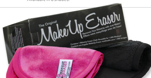
THE ORIGINAL MAKEUP ERASER® MAKEUP REMOVAL CLOTH $20 each

Yes, it takes off all your makeup with just water! (We're wowed, too.)