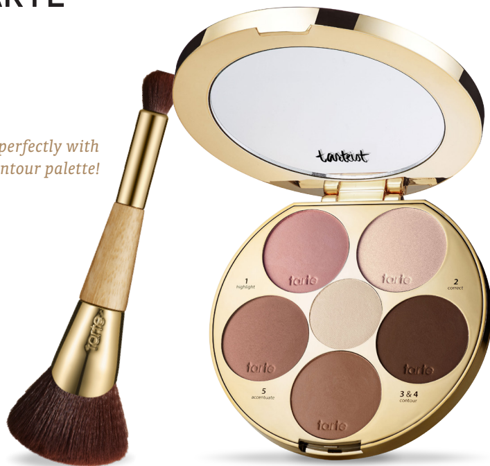
TARTEIST™ SCULPT & SLIM CONTOUR BRUSH $34

Pairs perfectly with the contour palette!