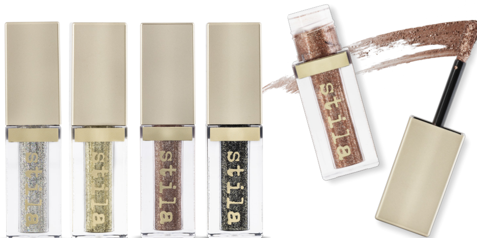
NEW MAGNIFICENT METALS GLITTER & GLOW LIQUID EYE SHADOW $24 each

BB LOVES: Say hello to glitter! Get on-trend eyes this season with buildable, super-sparkle eye shadow.